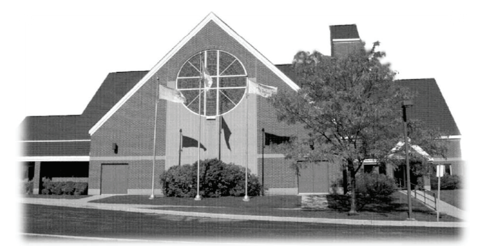
"... The seed is sprouting and growing ..." (Mark 4:27)